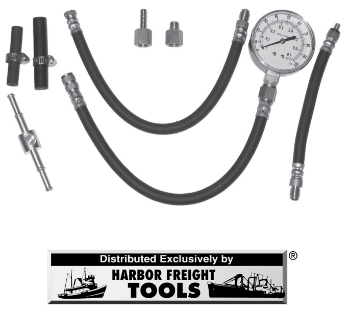
3491 Mission Oaks Blvd., Camarillo, CA 93011 Visit our Web site at http://www.harborfreight.com

Copyright © 2005 by Harbor Freight Tools<sup>®</sup>. All rights reserved. No portion of this manual or any artwork contained herein may be reproduced in any shape or form without the express written consent of Harbor Freight Tools.